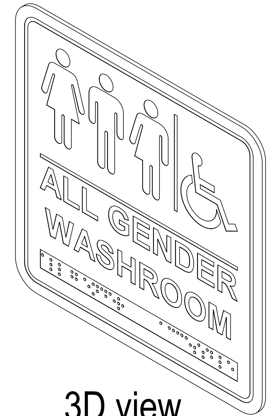
3D view Code 966

PROPRIETARY AND CONFIDENTIAL THE INFORMATION CONTAINED IN THIS DRAWING IS THE SOLE PROPERTY OF FROST PRODUCTS LTD. ANY REPRODUCTION IN PART OR AS A WHOLE WITHOUT THE WRITTEN PERMISSION OF FROST PRODUCTS LTD. IS PROHIBITED.