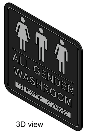
3D view Code 965