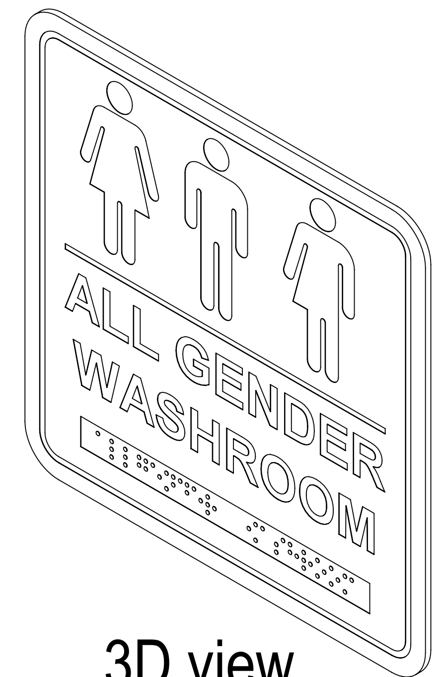
3D view Code 965

PROPRIETARY AND CONFIDENTIAL THE INFORMATION CONTAINED IN THIS DRAWING IS THE SOLE PROPERTY OF FROST PRODUCTS LTD. ANY REPRODUCTION IN PART OR AS A WHOLE WITHOUT THE WRITTEN PERMISSION OF FROST PRODUCTS LTD. IS PROHIBITED.