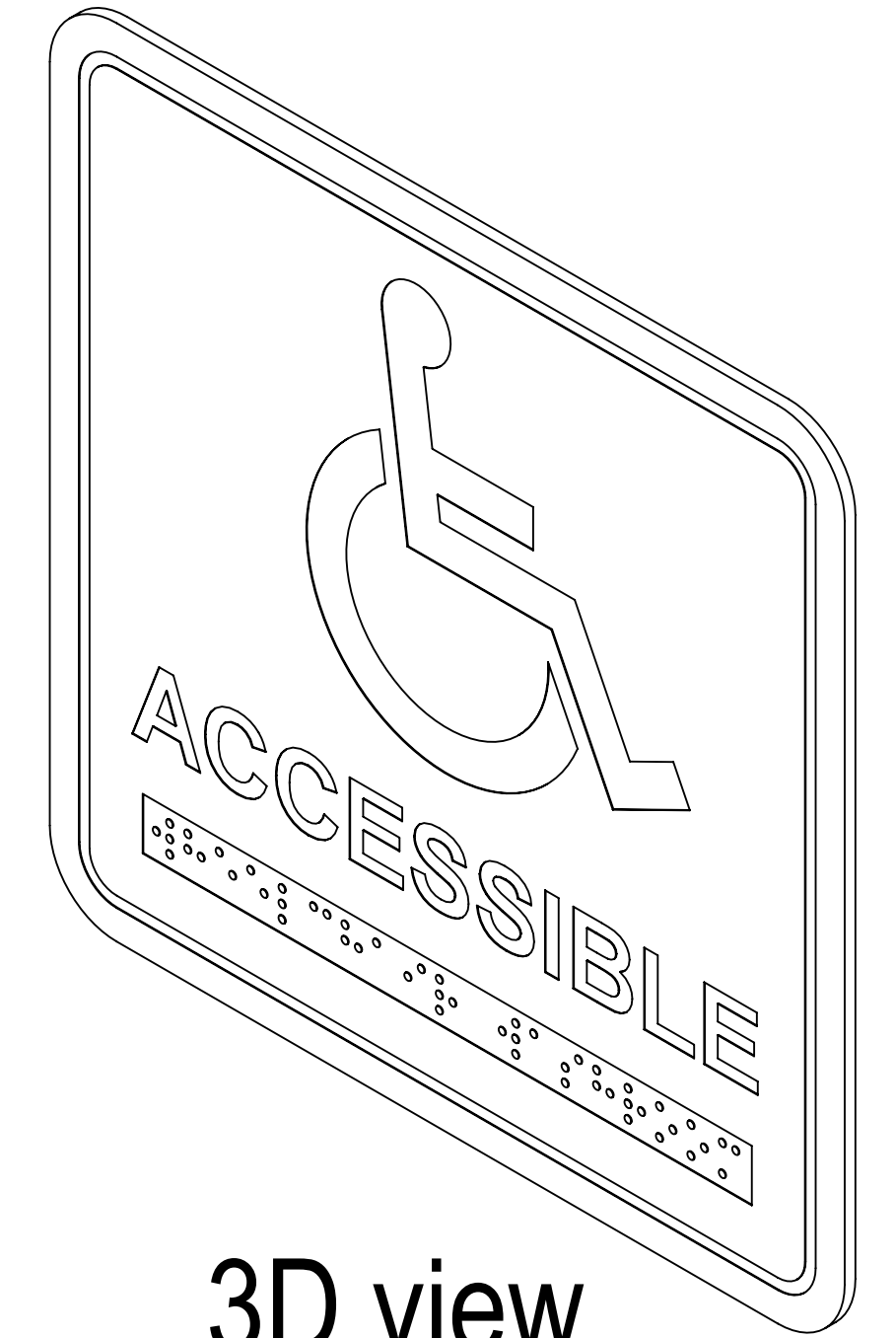
3D view Code 964

PROPRIETARY AND CONFIDENTIAL THE INFORMATION CONTAINED IN THIS DRAWING IS THE SOLE PROPERTY OF FROST PRODUCTS LTD. ANY REPRODUCTION IN PART OR AS A WHOLE WITHOUT THE WRITTEN PERMISSION OF FROST PRODUCTS LTD. IS PROHIBITED.