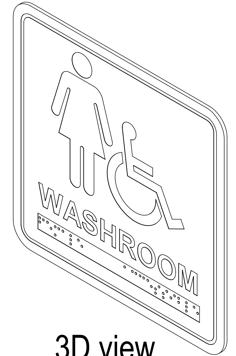
3D view Code 963

PROPRIETARY AND CONFIDENTIAL THE INFORMATION CONTAINED IN THIS DRAWING IS THE SOLE PROPERTY OF FROST PRODUCTS LTD. ANY REPRODUCTION IN PART OR AS A WHOLE WITHOUT THE WRITTEN PERMISSION OF FROST PRODUCTS LTD. IS PROHIBITED.