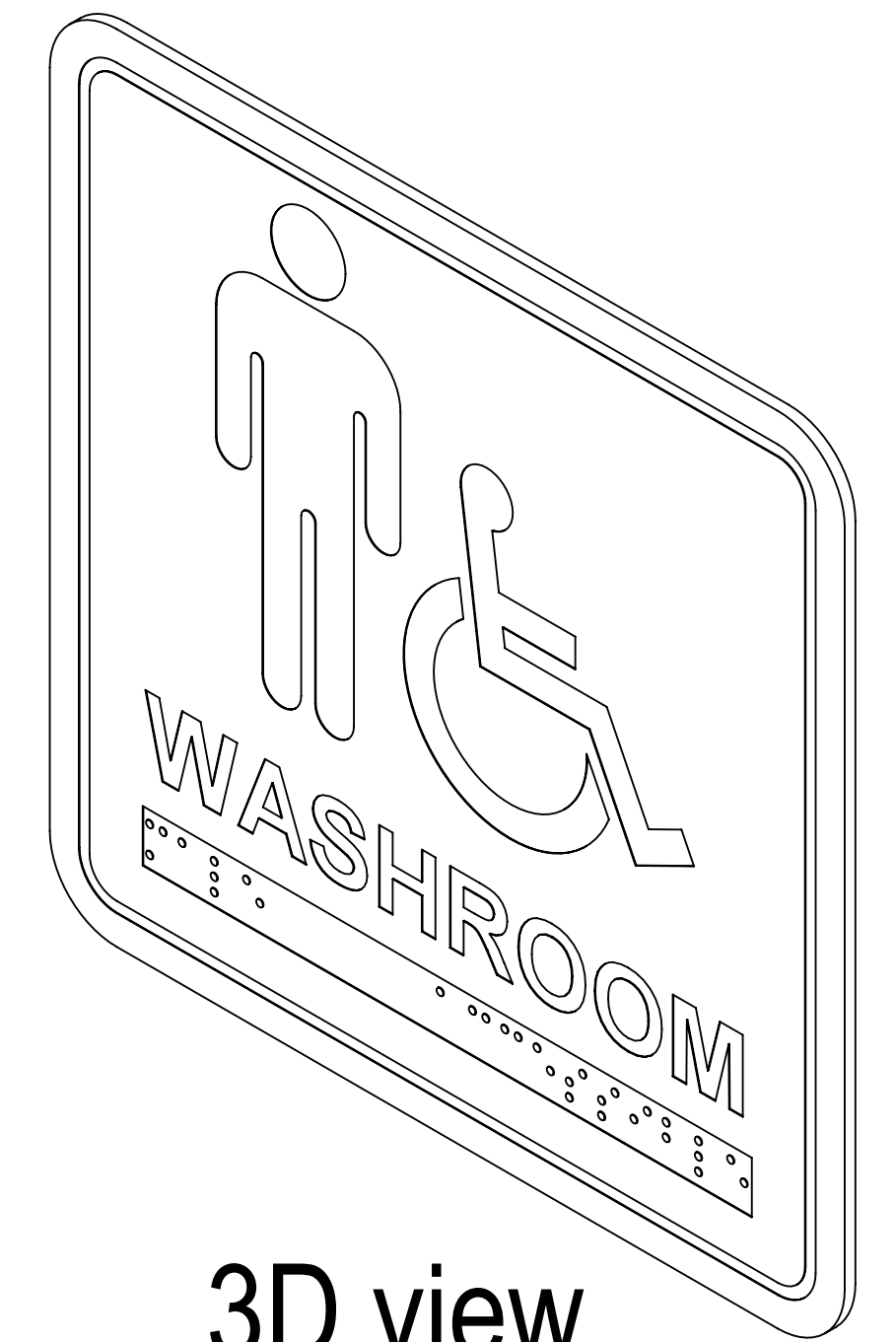
3D view Code 962

PROPRIETARY AND CONFIDENTIAL THE INFORMATION CONTAINED IN THIS DRAWING IS THE SOLE PROPERTY OF FROST PRODUCTS LTD. ANY REPRODUCTION IN PART OR AS A WHOLE WITHOUT THE WRITTEN PERMISSION OF FROST PRODUCTS LTD. IS PROHIBITED.