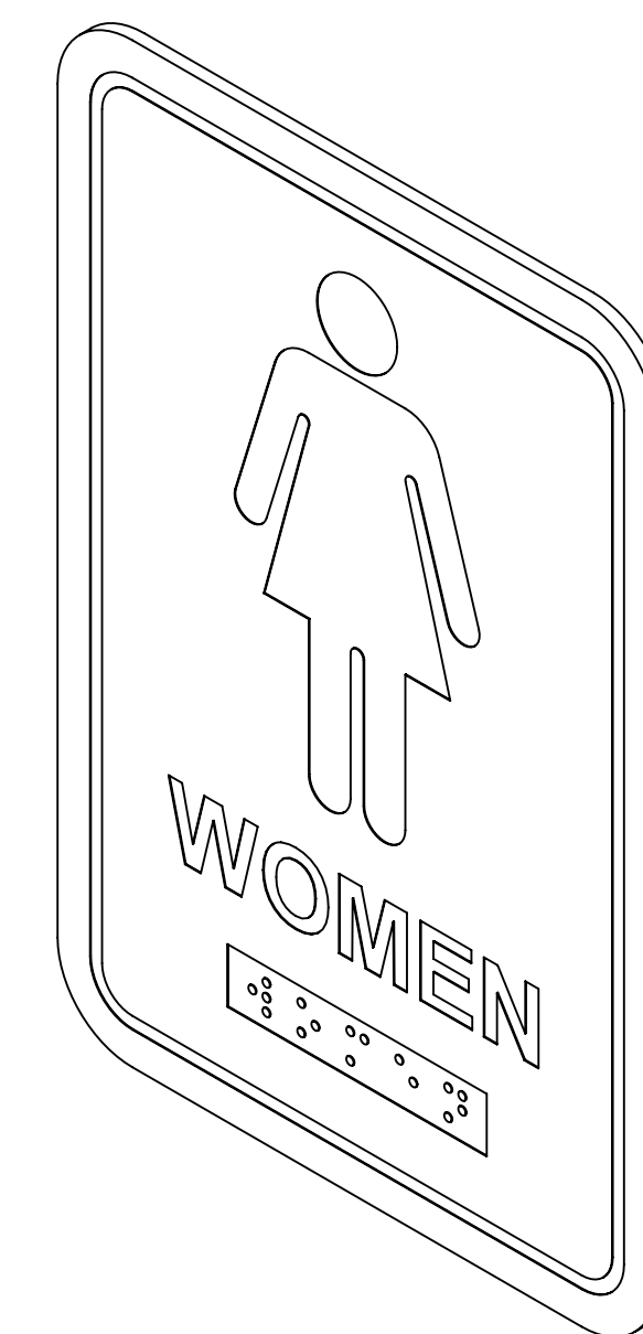
3D view Code 961

PROPRIETARY AND CONFIDENTIAL THE INFORMATION CONTAINED IN THIS DRAWING IS THE SOLE PROPERTY OF FROST PRODUCTS LTD. ANY REPRODUCTION IN PART OR AS A WHOLE WITHOUT THE WRITTEN PERMISSION OF FROST PRODUCTS LTD. IS PROHIBITED.